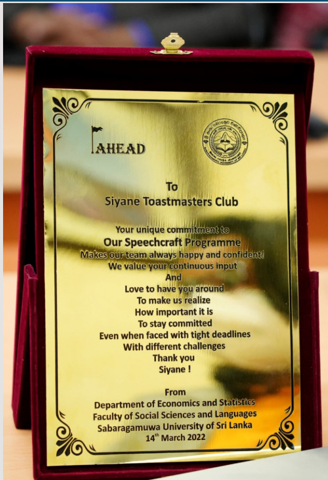
Grand Finale and Awards Ceremony - Speechcraft Programme Department of Economics and Statistics, SUSL