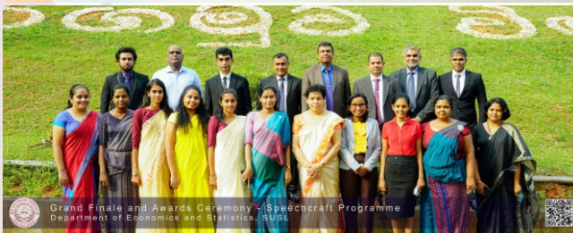
Grand Finale and Awards Ceremony - Speechcraft Programme Department of Economics and Statistics, SUSL